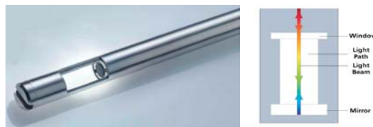
Figure 2. Image of an In-situ IR probe and a diagram of the probe's measurement principle

code - ATS10360), the optional small in-situ IR probe (Part code - ATS10230) and the optional large in-situ IR probe (Part code - ATS10394)