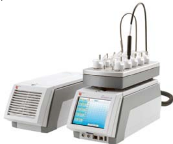
Figure 1. Electrothermal's Integrity 10 STEM Block (Clarity Solubility Station)

This application note will also compare the current small in-situ IR probe and a new large in-situ probe when used to determine the nucleation and solubility points of a viscous solution.